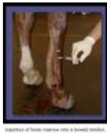
Injection of horse response into a blood vessel.